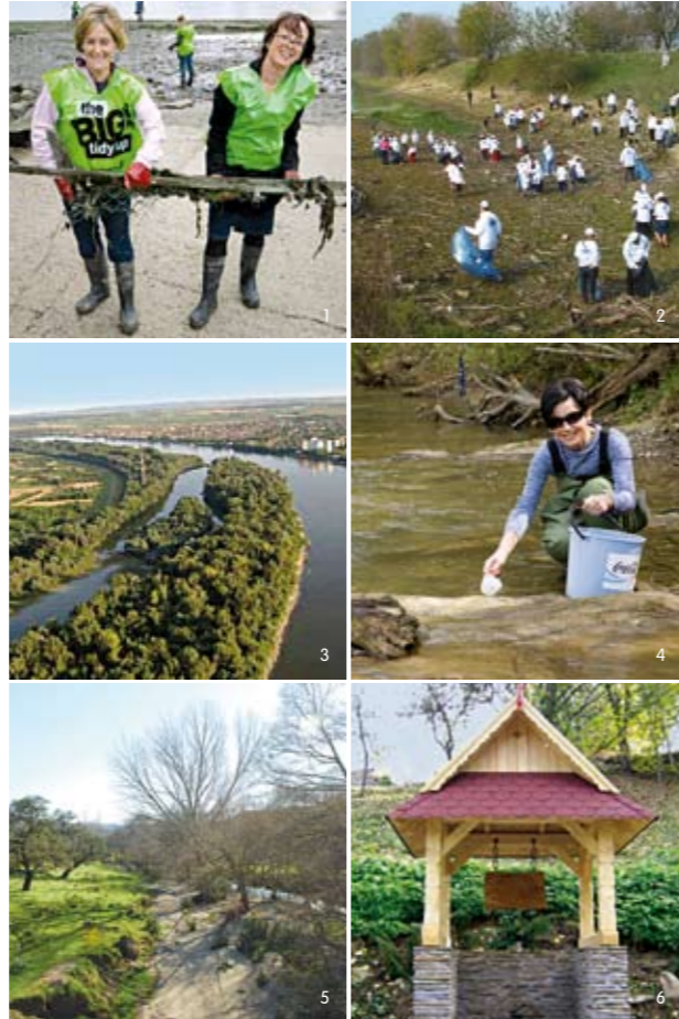
1: Coca-Cola employees helping to clean-up the Thames 2: First clean-up project on Lake Kerkini involving Coca-Cola Hellenic employees, volunteers, ngos and students 3: Liberty Island, the focus of international efforts to restore the habitat and improve biodiversity 4: Restoring the salmon population in the Upper Vistula River 5: Guadiana River Recovery in Spain: reforestation of 30 hectares 6: A finalised community project financed by the Kropla Beskidu Fund.

Meanwhile the 'Guadiana River Project' project in Portugal and Spain is a cross-border initiative we are supporting with WWF and local administrations. The project aims to protect and restore the Guadiana river basin, where the