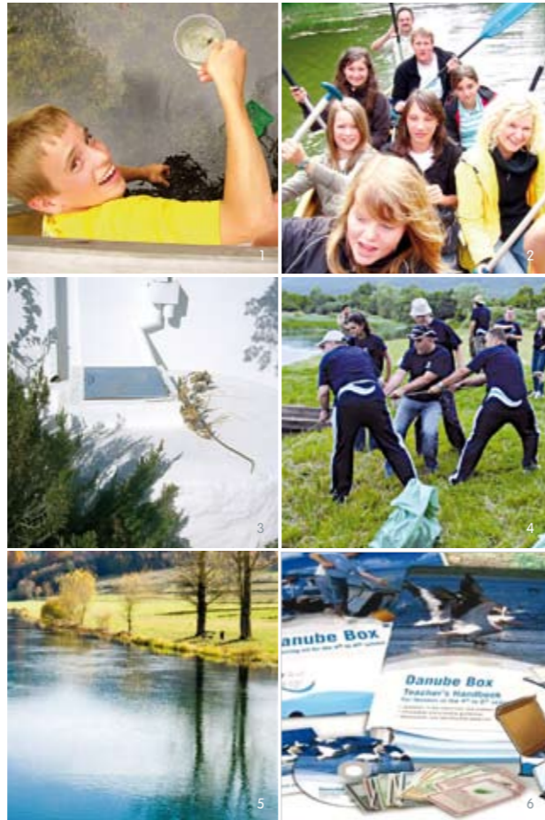
Images above: 1-2: Young people from Austria learning about the Danube's ecosystem 3: Rainwater harvesting installation at public school, Syros Island in Greece 4-5: 'Adopt a river' in Croatia encourages local care of the river 6: Educational materials for schools in the region (Danube-Box).